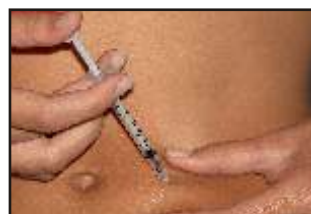
With Gonal-f Multi-Dose 450 IU