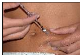
With Gonal-f RFF 75 IU