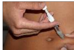
With Cetrotide 0.25mg