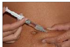
With Cetrotide 3mg